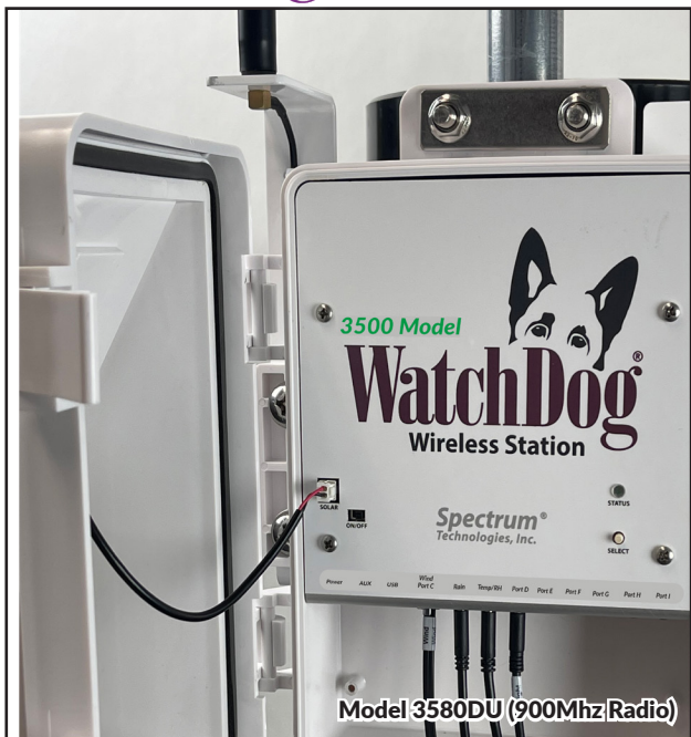
Model 3580DU (900Mhz Radio)